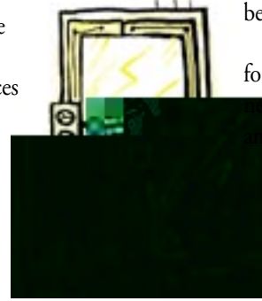
A BLOWER DOOR TEST CAN REVEAL WHETHER YOUR HOME HAS AIR LEAKS AND HOW TIGHT YOUR HOUSE IS.

You can stop this great heat escape by sealing up your house. Before you begin, though, be sure to first correct any moisture or indoor air quality problems in your house, because air-sealing could make them worse. It's also very important to make sure all combustion appliances such as furnaces and water heaters are working right and are properly vented. Read the Power Bill brochures on condensation control, indoor air quality, gas appliances, and carbon monoxide for more information.